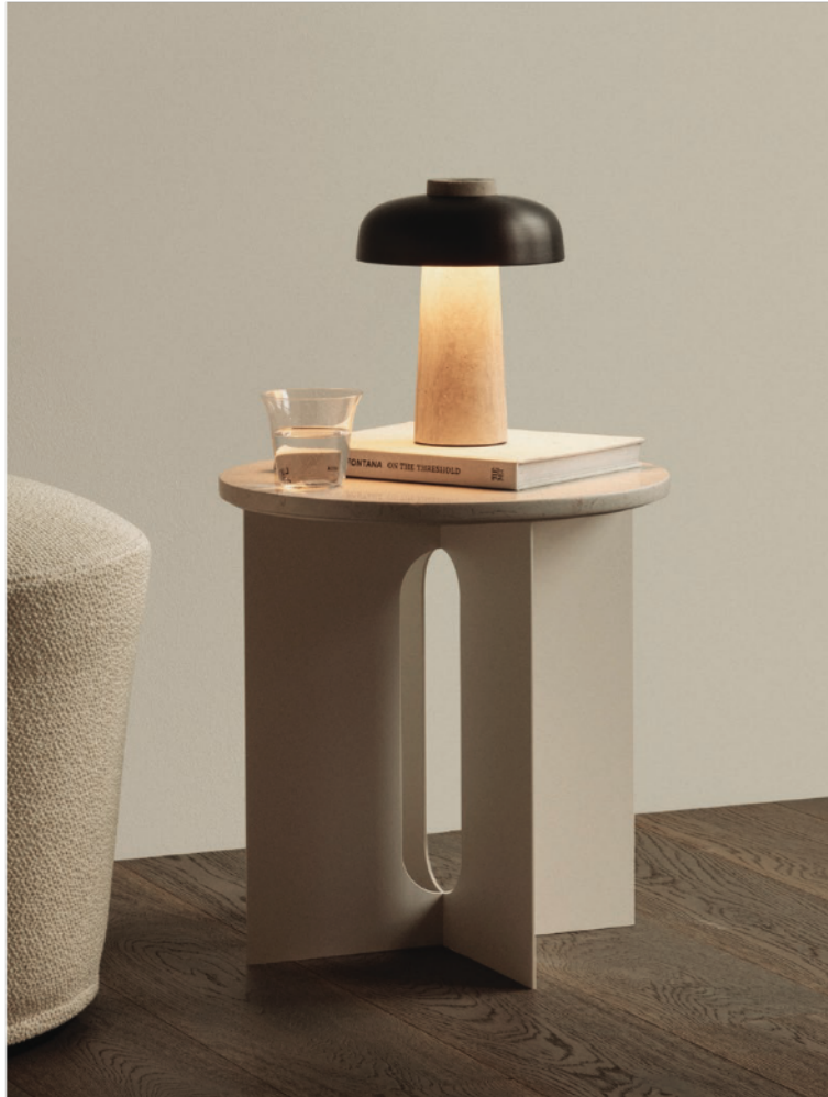
REVERSE TABLE LAMP, PORTABLE Designed by Aleksandar Lazic