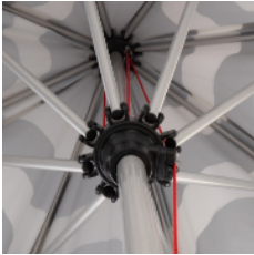
Quick release mechanism