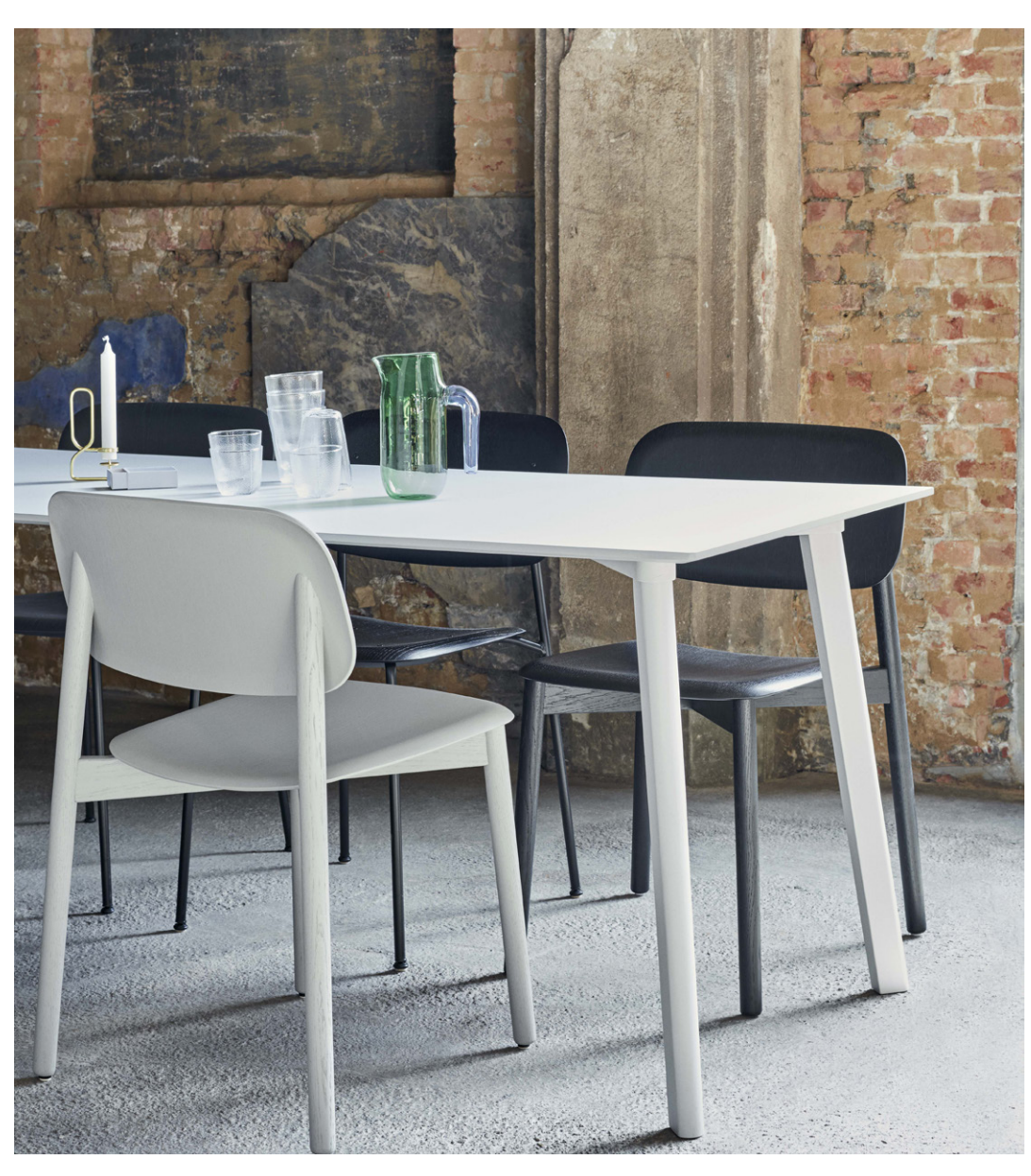
CPH Deux 210 Table | Pearl white laminate tabletop | Pearl white beech base