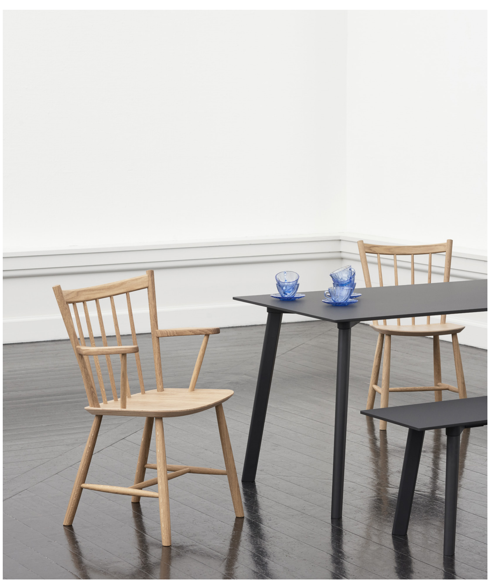
CPH Deux 210 Table | Ink black laminate tabletop | Ink black beech base