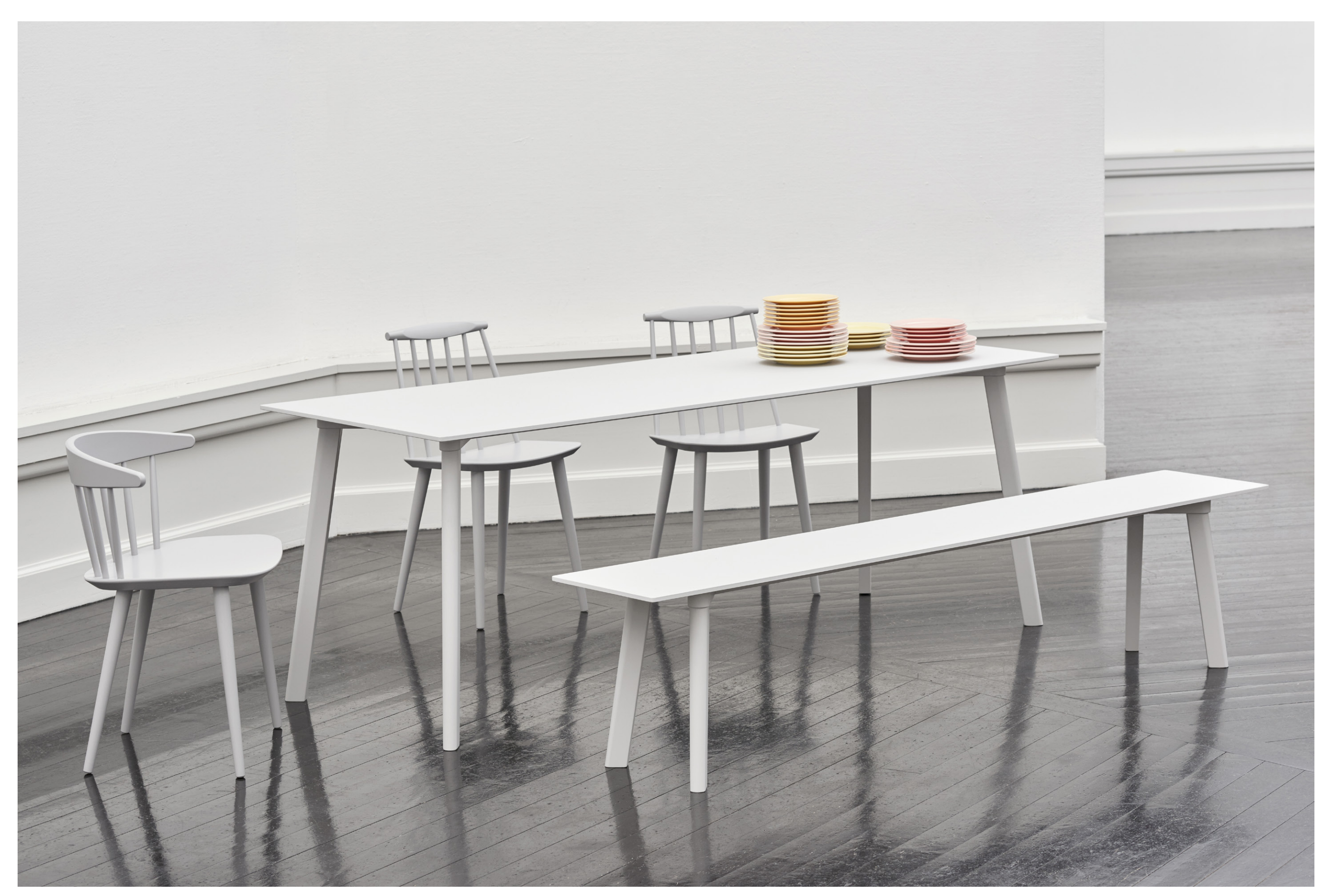
CPH Deux 210 Table | Pearl white laminate tabletop | Pearl white beech base