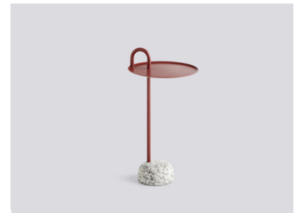
TILE RED 933511 350 9000