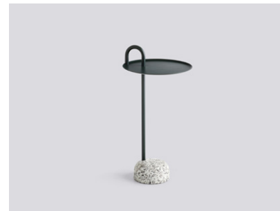
FIR GREEN 933511 300 9000