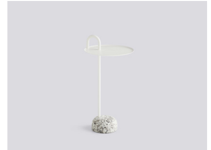
CREAM WHITE 933511 150 9000