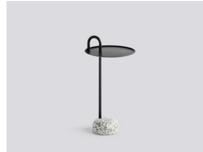
BLACK 933511 100 9000