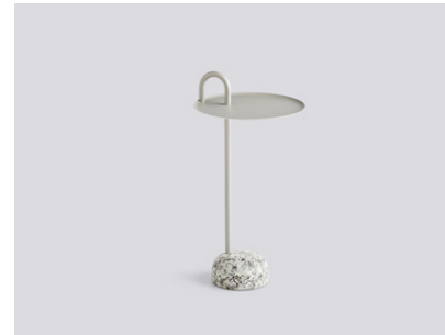
BEIGE 933511 200 9000