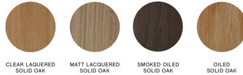
CLEAR LACQUERED SOLID OAK