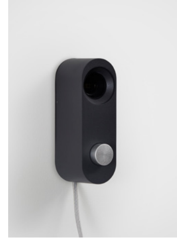
Wall Sconce installation