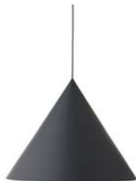
ø20 cm. Matt grey: art.no. 100460 ø46 cm. Matt grey: art.no. 100537 Grey fabric cord