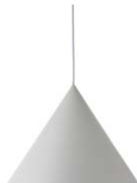
ø20 cm. Matt white: art.no. 100464 ø46 cm. Matt white: art.no. 100546 White fabric cord