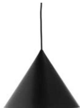
ø20 cm. Matt black: art.no. 100461 ø46 cm. Matt black: art.no. 100542 Black fabric cord