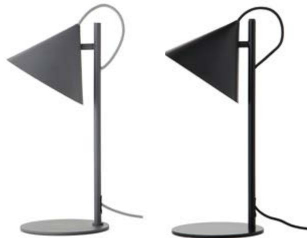
Matt grey: art.no. 101383 Grey fabric cord