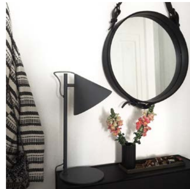
Matt black: art.no. 104149 Black fabric cord