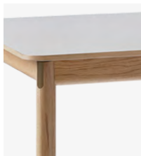
White oiled oak