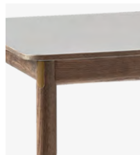
Smoked oiled oak