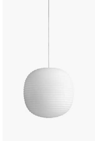
Lantern Pendant, Medium (Ø 300 mm)