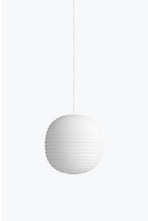
Lantern Pendant, Small (Ø 200 mm)