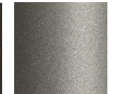
SILVER GREY 170