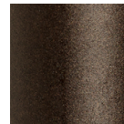
BROWN BRONZE 390