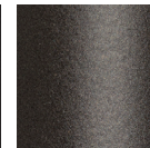
WARM GRAPHITE 180