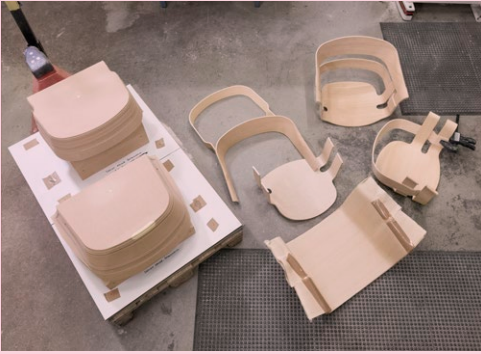
Wick Chair is manufactured in Nybro, in the Swedish furniture industry's heartland.