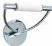
shiny chrome tuttopalascente cod 581