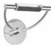
satin chrome retinato cod 1516