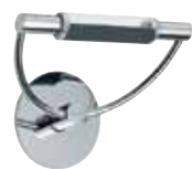
shiny chrome retinato cod 516