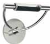
satin nickel-plated retinato cod 586