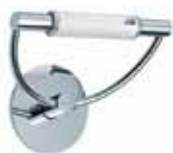
shiny chrome opalescente cod 527