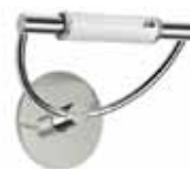
satin nickel-plated opalescente cod 587