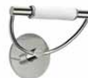
satin nickel-plated tuttopalascente cod 588