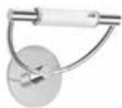
satin chrome opalescente cod 1527