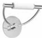
satin chrome tuttopalascente cod 1581