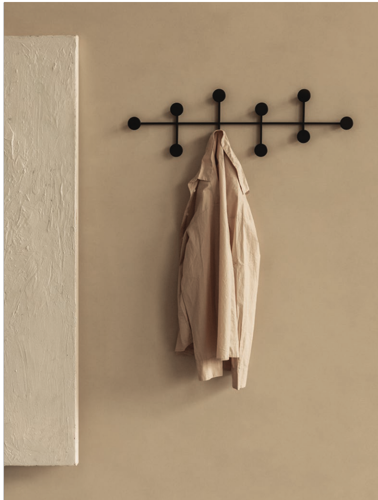
AFTEROOM COAT HANGER Designed by Afteroom